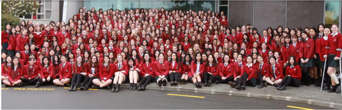
Our new Year 13 members of the Westlake Girls Alumni Community