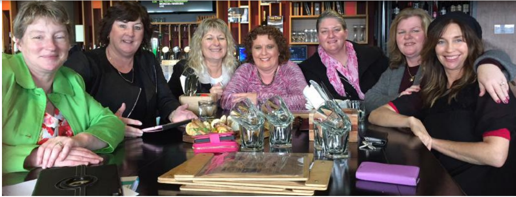
A group from 3Cu 1981