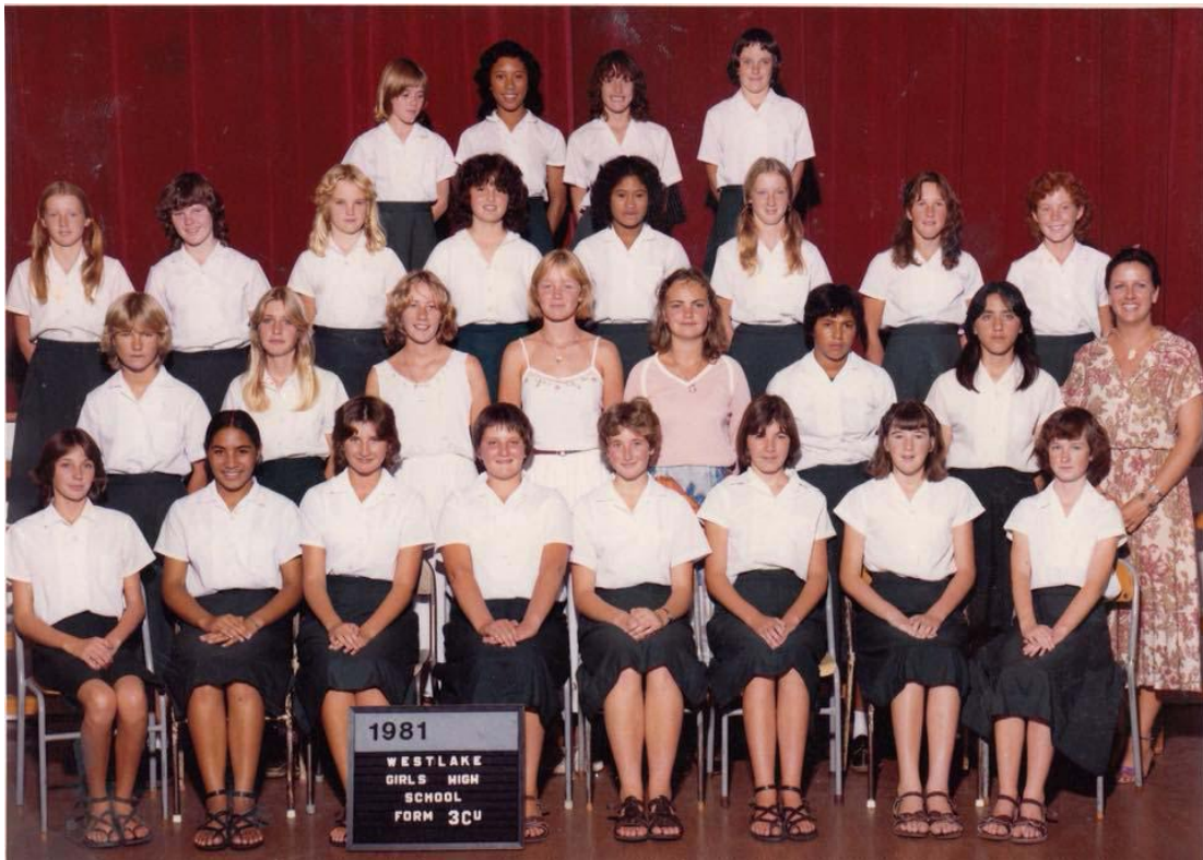
Form 3Cu in 1981

The growing number of members in our Facebook groups is helping with connections such as this. There are now 3,400 members across all alumni year groups.