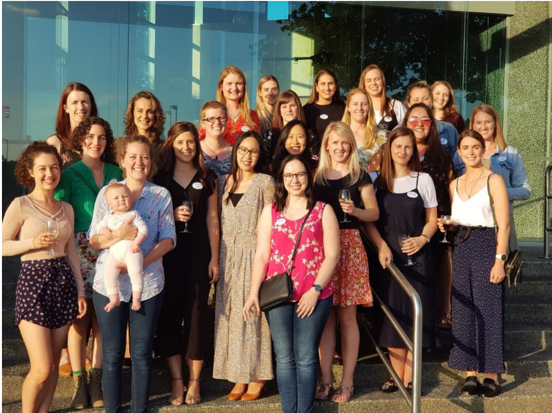
The Class of 2008

Over 60 more former students joined the 2008 Class FB group through the year, thanks to the efforts of Brooke and others who got on board to spread the word.