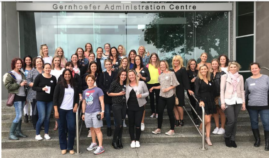
The Class of 1998