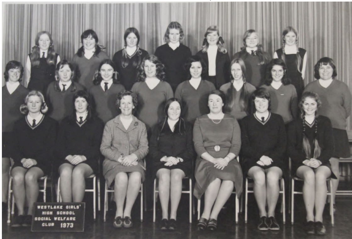
The Social Welfare Group 1973

Westlake students have been involved in community activities since its earliest days. Students from the '1973 Welfare Club' visited local rest homes and hospitals including the Lady Allum home, donating blankets they had made with knitted 'peggy squares' and putting on concerts.