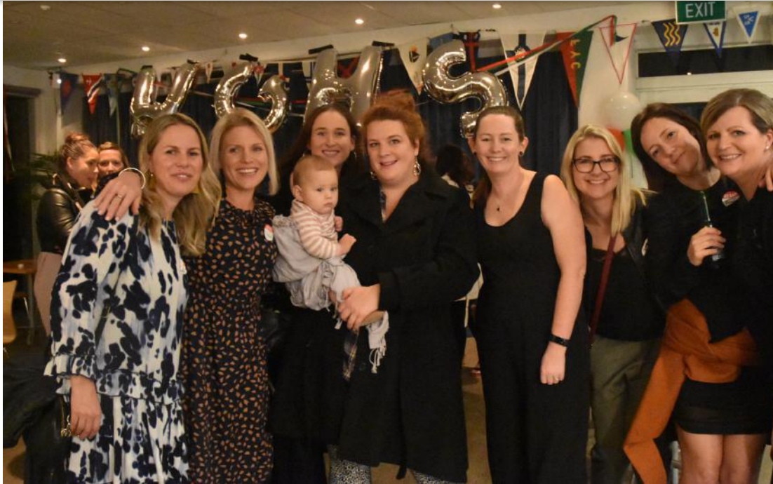
A group from the Class of '99 at the Takapuna Sailing Club