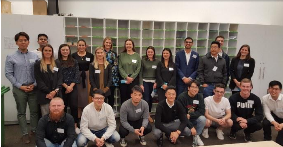
WGHS and WBHS - Alumni presenters at the Careers afternoon