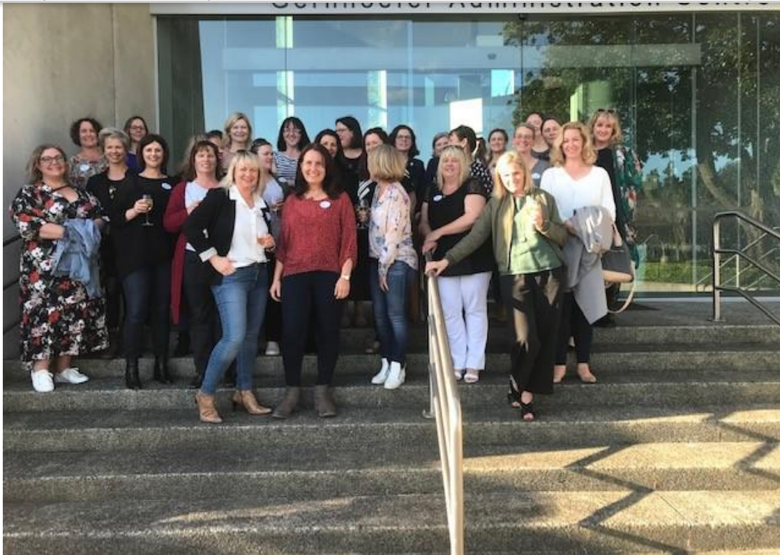
Alumni from the Class of '89 enjoyed a look around their old school.