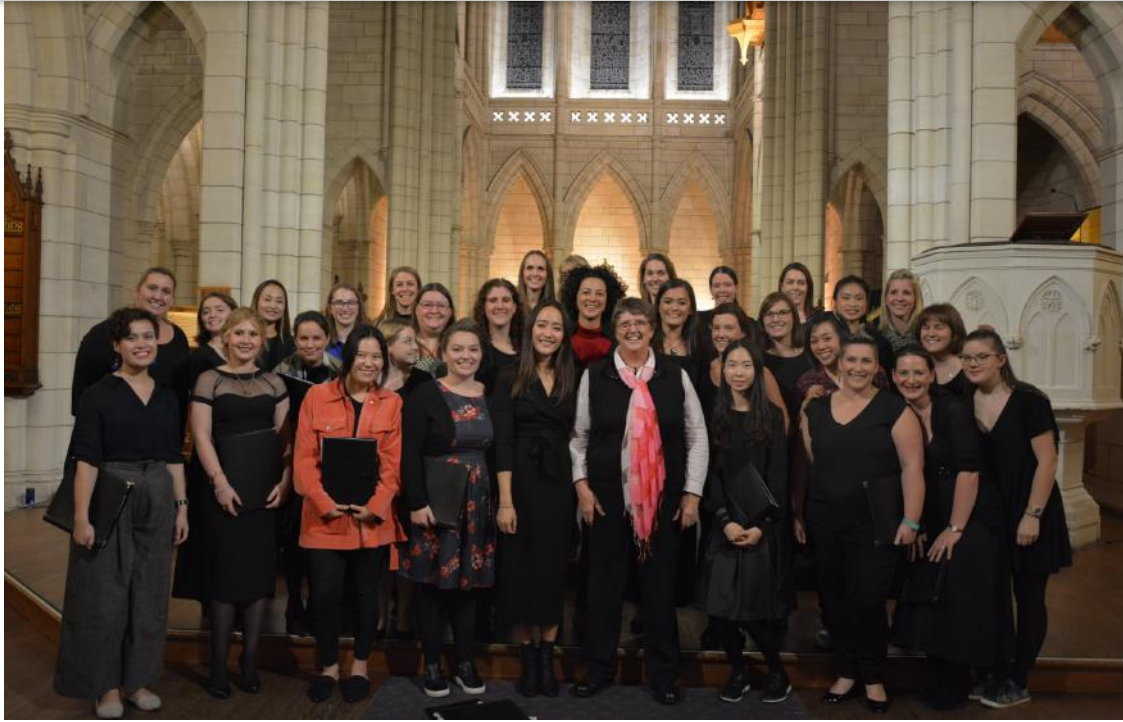
Key Cygnetures Reunion Choir