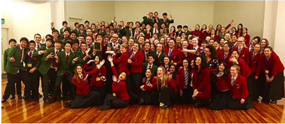
Westlake Choirs celebrating in Dunedin