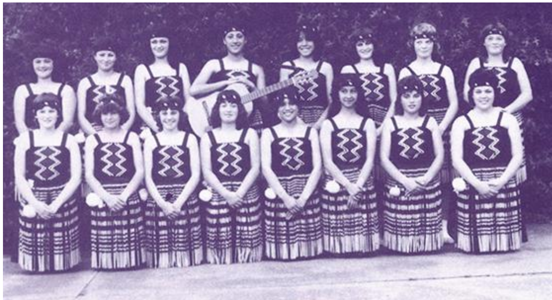
The Multi-Cultural Group in 1983